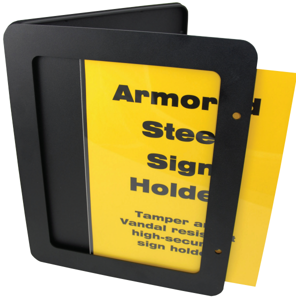
Easy slide in graphic installation