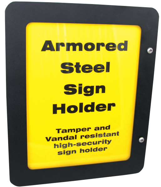
Torx high security screws keep unit closed